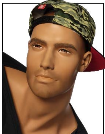
Conrad/1 Body colour: California Make-up: MU301 Hair shading