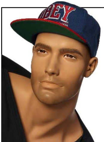
Conrad/1 Body colour: California Make-up: MU301 Hair shading