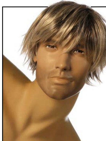
Conrad/1 Body colour: California Make-up MU301 Wig: Björn

When using regular trousers, use Continental size 52, UK 42 = Waist 87 cm/34" cm.