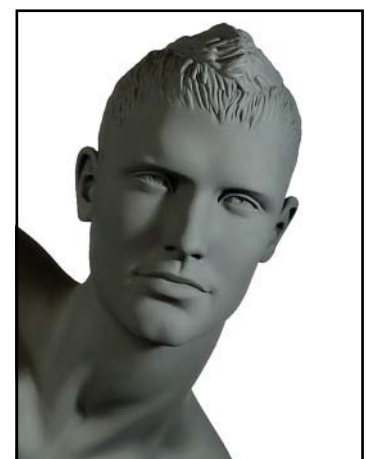
Conrad/2 Body colour: Dark grey suede look