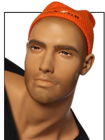
Conrad/1 Body colour: California Make-up: MU301 Hair shading