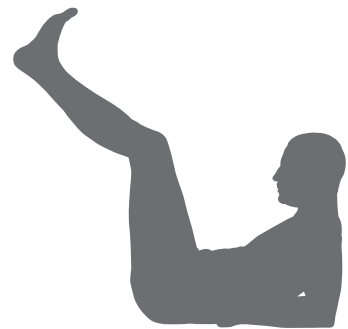
In the pipeline BoxMan 446