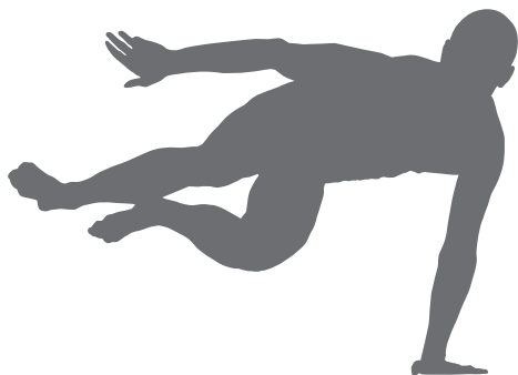
In the pipeline BoxMan 450