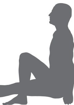
In the pipeline BoxMan 447