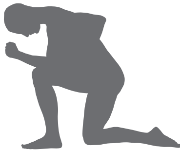
In the pipeline BoxMan 445