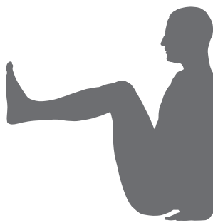
In the pipeline BoxMan 448