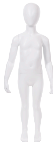
ATLAC20_WH 4 Y UNISEX