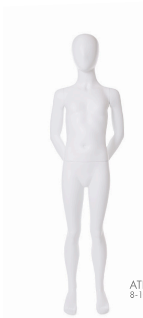
ATLAC22_WH 8-10 Y GIRL