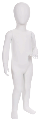
ATLAC29_WH 18-24 M UNISEX