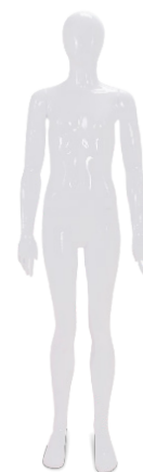
ATLAC24_WH 11-12 Y GIRL