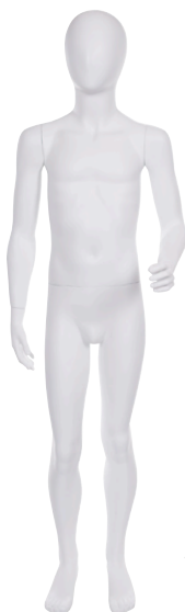
ATLAC23_WH 8-10 Y BOY