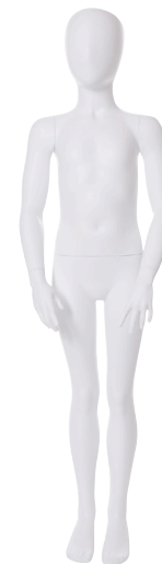
ATLAC21_WH 6-7 Y UNISEX