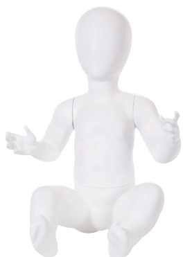
ATLAC28_WH 6-12 M UNISEX