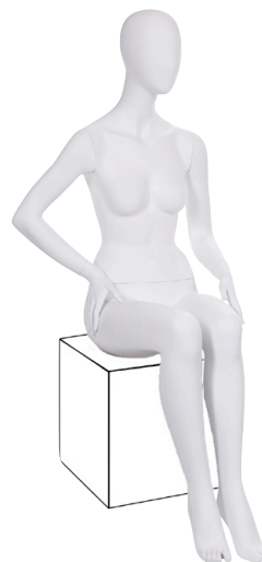
ATLAF04_WH CUBE HEIGHT 45 CM